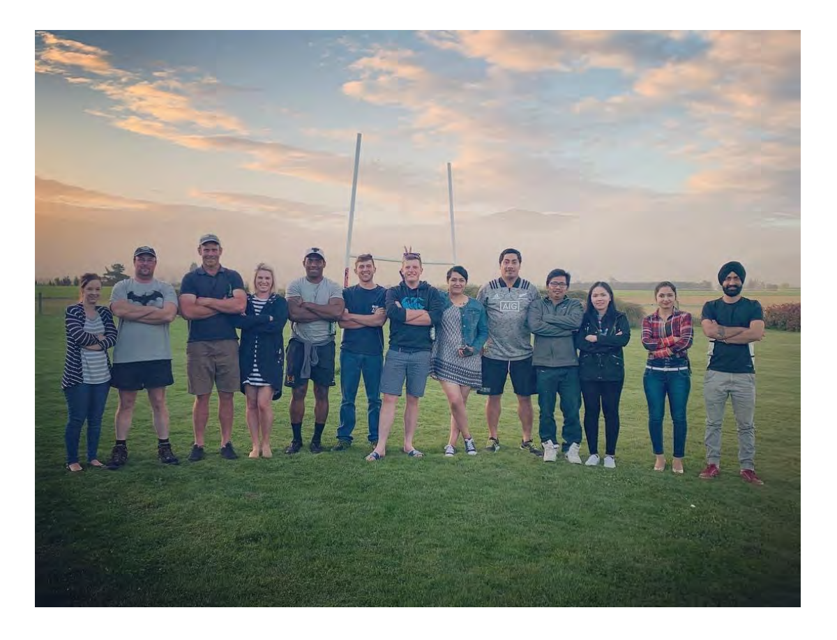
Our staff and their partners.