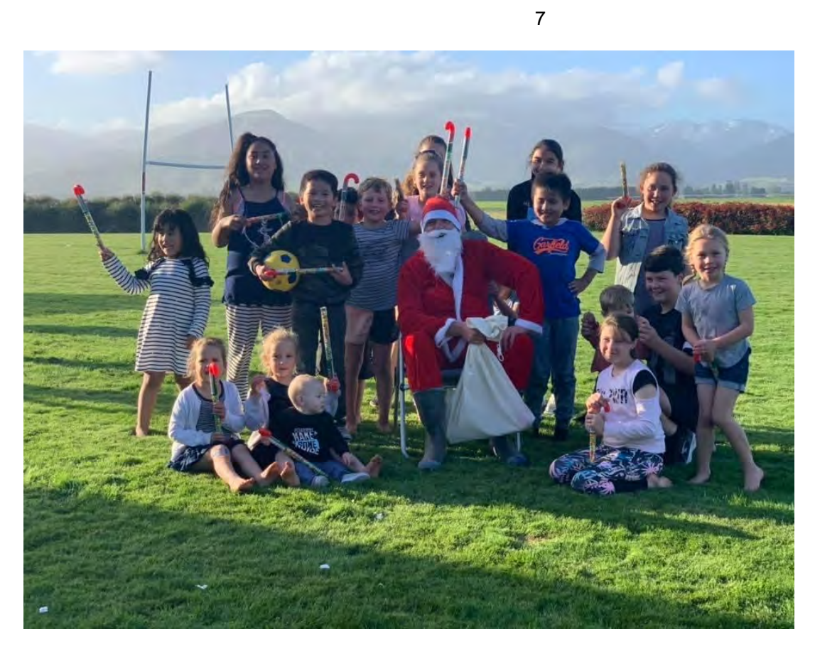
Some of the children who live on our farms!