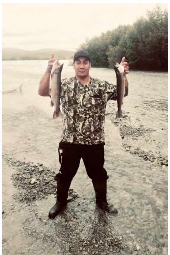
Our staff and their children fishing in the South Opuha River and Lake Opuha