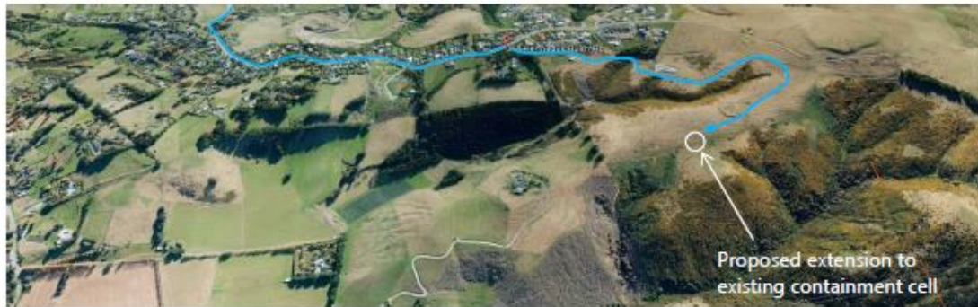
Figure 2: Location of proposed extension to the containment cell on land at 318 Kennedys Bush Road.