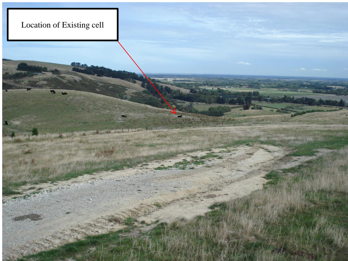
Figure 2: Existing Earthbund containment cell at May 2016