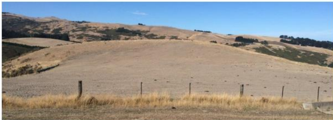
Figure 4: The existing containment cell after earthworks were completed in March 2015 (looking south).

Figure 1 location of proposed cell, construction of existing containment cell, and finished cell.