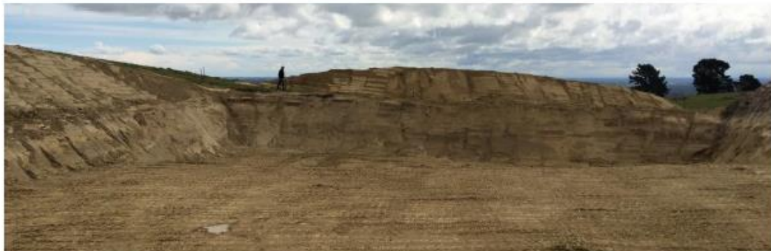
Figure 3: The existing containment cell during excavation earthworks in November 2014 (looking west).