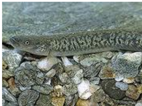
Upland longjaw galaxias