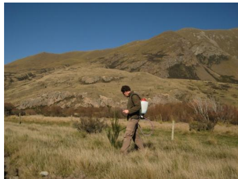
Weed spraying upper Rangitata