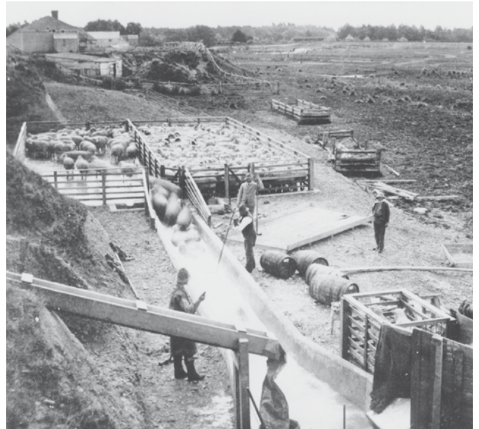
Sheep dipping (ABOVE) and gas works (TOP) are among the former land uses that have been identified as potentially hazardous.