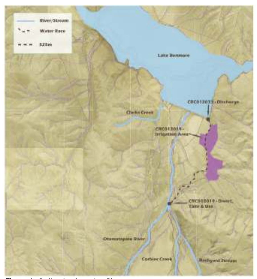
Figure 1- Indicative Location Plan